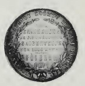
Lot No. 2625

Florin, 1875. Obv. Older head. Rv. Inscription. Commemorates the reopening of the Pribram Mine. Y.17. Lightly toned. Uncirculated with prooflike surfaces. (450–550)